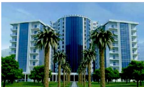
THE MAIN PROJECT Apart hotel TRE CANNE – DUP "Budva centar" 'in' Budva 35.000 m 2 , 2009. god.,