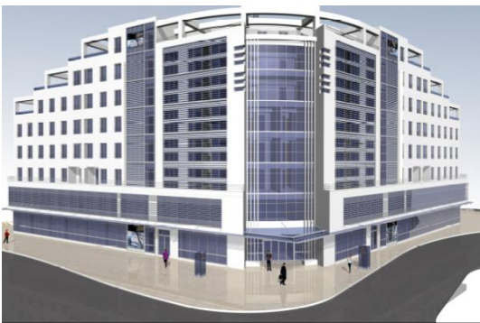
THE MAIN PROJECT – Business and residential building Biznis centara “Nikic” DUP “Stara Varos” blok 7, u Podgorici -13.500m 2 , 2006