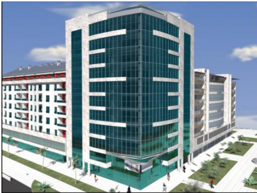
THE MAIN PROJECT – Business and residential building Normal Company DUP “Kruševac” zona “B”, building 4 in Podgorica – 6.500 m 2 , 2006. god.,