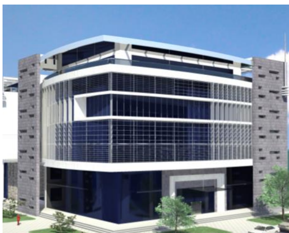
Designing project - Commercial Building of "CANU" the ( Montenegrin Science and Art Academy ) DUP "Nova Varoš 2", in Podgorica – 4.500 m 2 , 2009. god.