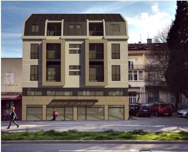
THE MAIN PROJECT - Business residential building DUP "Nova Varos" u Podgorici – 800m 2 , 2014. god.