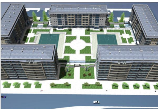
THE MAIN PROJECT - Business residential complex Citi Kvart DUP “Radoje Dakić” u Podgorici – 40.000m 2 , 2007. god.