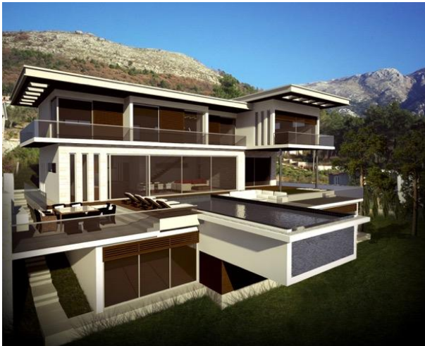
CONCEPTUAL DESIGN – private vila in Kotor 800 m 2 , 2014.