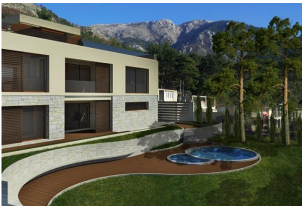
THE MAIN PROJECT – private vila in Kotor 400 m 2 , 2015.