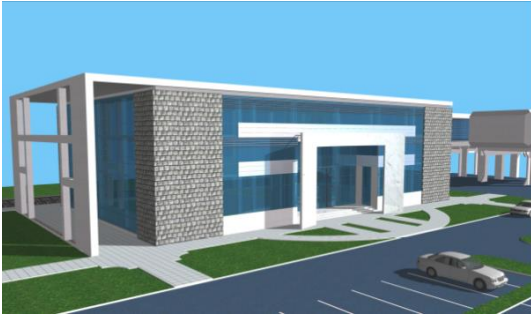
THE MAIN PROJECT – Commercial Building DUP “Rekreativno-kulturna zona na obali rijeke Morače-sjeverni dio” in Podgorica –3.500 m 2 , 2004. god.,