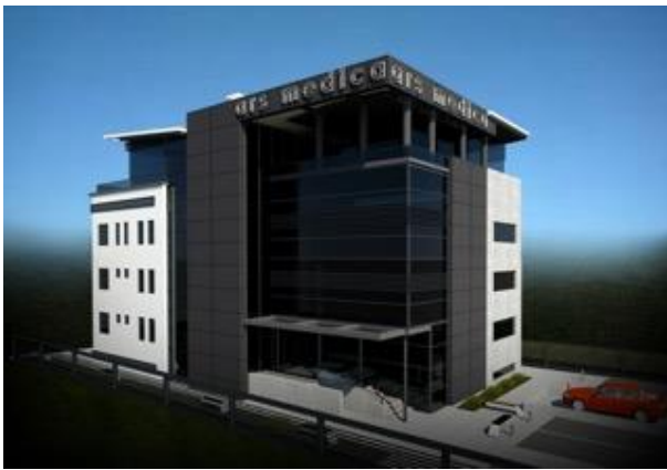
THE MAIN PROJECT Medical Centar –ARS MEDICA upgrading and extension 2.000 m 2 , 2012.