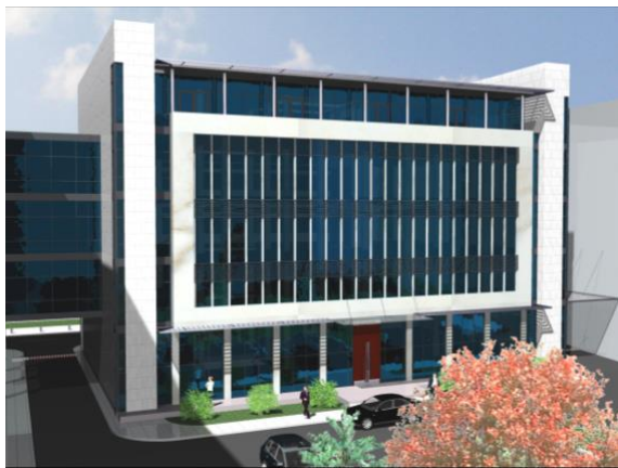
Designing project Building of The Montenegrin Government DUP "Nova Varoš" in Podgorica – 8.000 m 2 , 2009. god.,